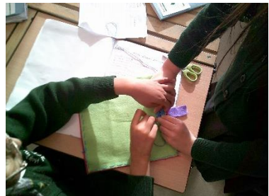
Year 4 enjoyed making the book sleeves they had designed in DT last half term. Lots of sewing, threading needles, knotting and decorating, and lots of fun had while doing so!