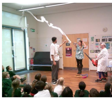
The Silly Science Workshop was enjoyed by all year groups.