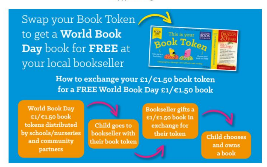
Please see the attached letter for more information.