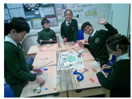
Year 5 have been creating their own printing plates to create collographs.