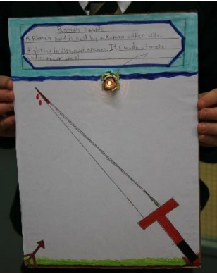
Year 3 had a great time assembling their electric posters as part of their information design unit in DT.