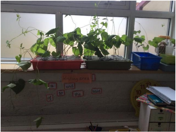
Before half term Reception planted their beans - look how they have grown!