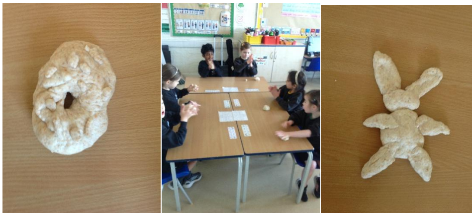
2B thoroughly enjoyed their breadmaking workshop run by Caterlink.