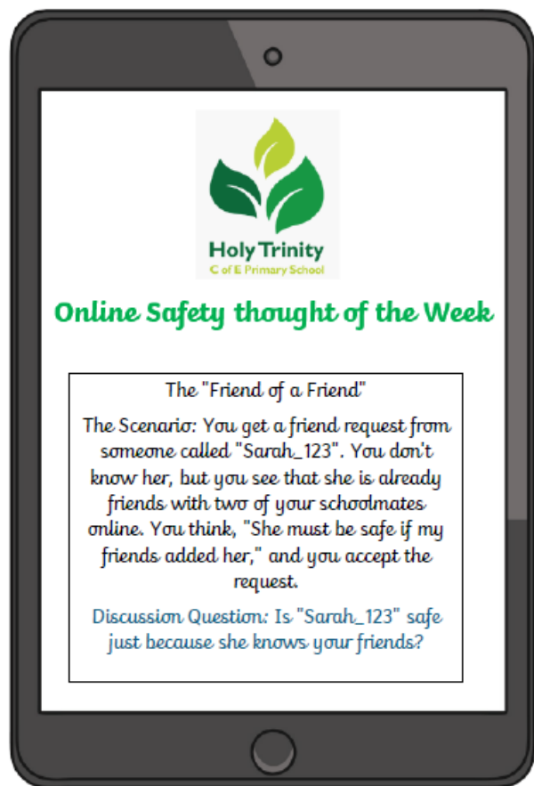
KS2 Online Safety Thought