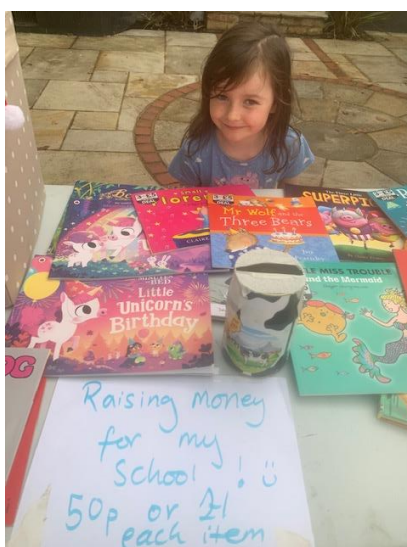
One of our industrious Year 1 pupils organised a sale of her own toys and books last weekend, and raised £18 for HOTS. Thank you so much!