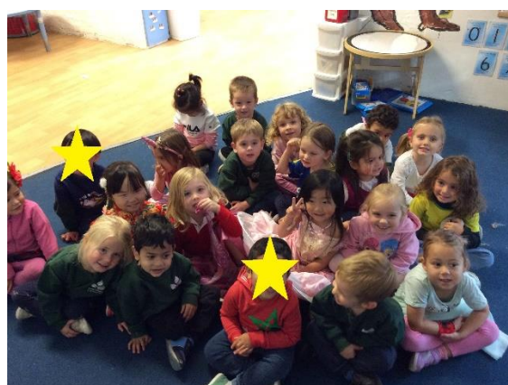
Nursery's topic this term has been 'All About Me'. Today Nursery celebrated the diversity within the class by dressing in colours and native attire to represent where their families come from.