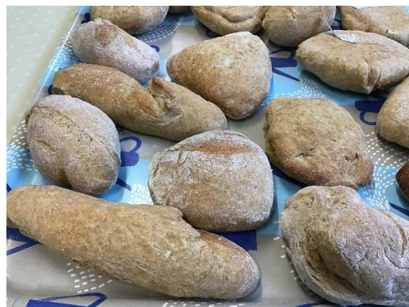
Budding bakers in the making! The Reception children loved baking bread today.