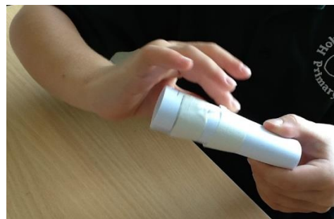
Year 2 have completed their Design and Technology unit called Baby Bear's Chair. We thought about how to make our structures stable and strong enough to support Baby Bear.