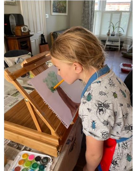
Amazing mouth painting!