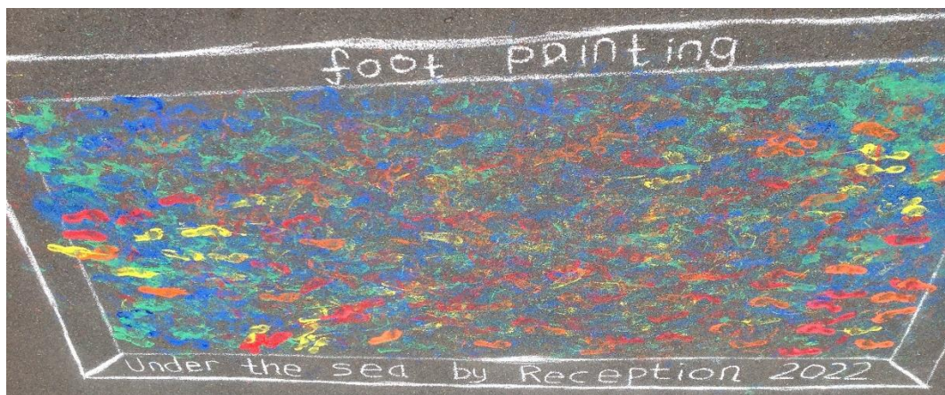
Reception enjoyed getting their feet messy!