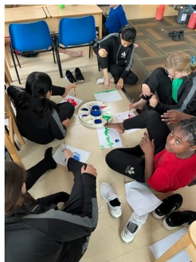
Year 6 foot painting!