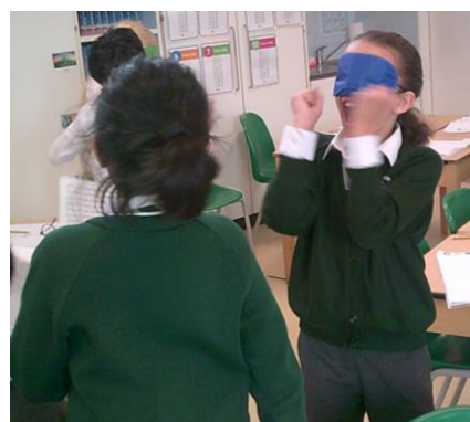
As part of their English learning, Year 4 children re-enacted the moment Aladdin was trapped in the dark cave by his wicked uncle.