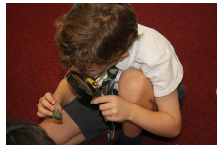
Year 3 having a great time learning about igneous, sedimentary and metamorphic rocks in their science lesson!