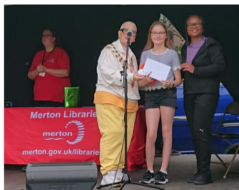
Summer Reading Challenge success Many congratulations to one of our Year 6 pupils who was selected as one of the prize winners from the Summer Reading Challenge. Here she is receiving her prize from the Mayor of Merton and the cabinet member for Sport and Heritage. Many congratulations.