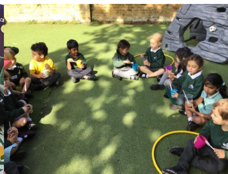
The Reception children made apple crumble today. The children chopped the apples and they discussed where they come from and related it to Harvest.