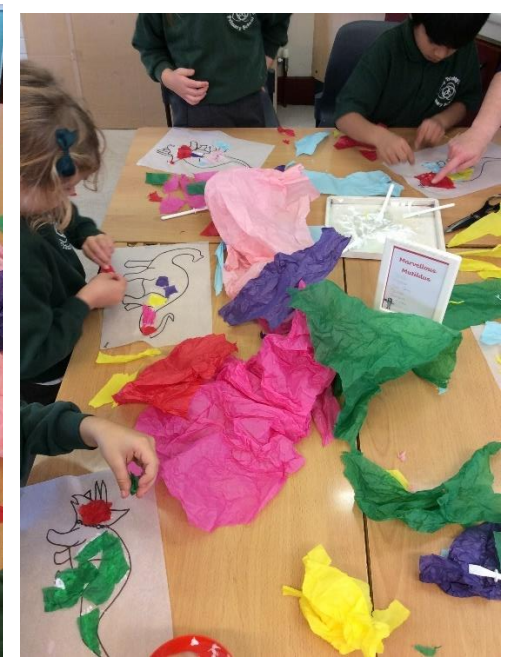
Year I created their own dinosaurs today.