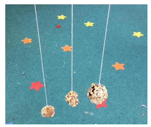
In their science lessons, Year I have been learning about animals. They made bird feeders to help feed the birds.