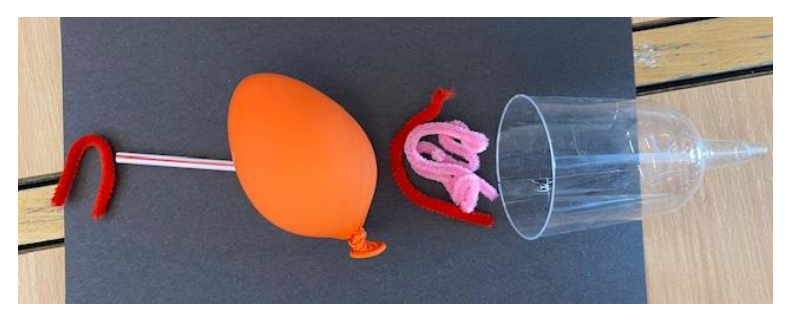
Year 4 had such fun making 3D models of the digestive system in their science lessons.