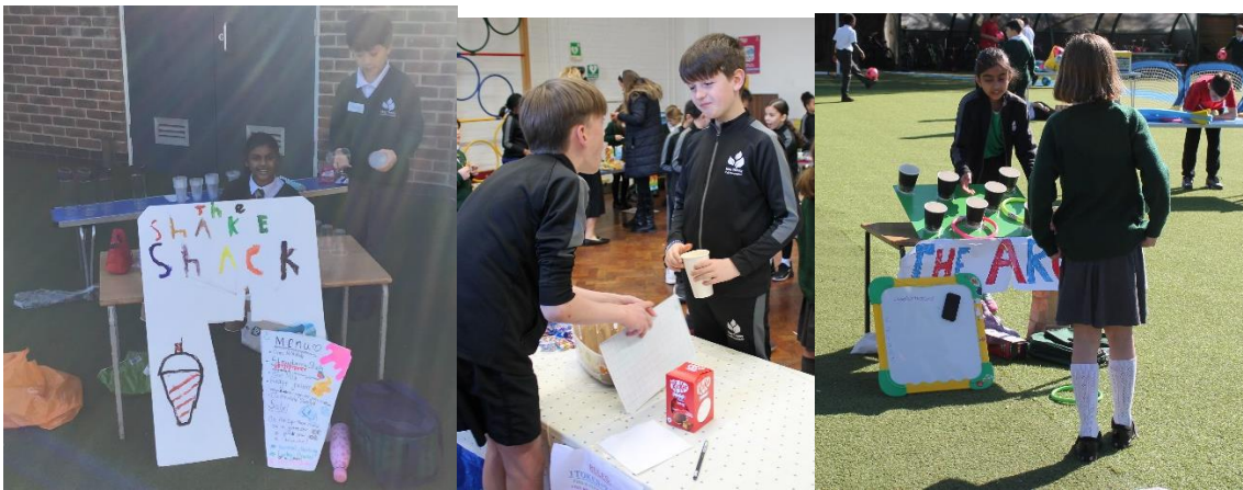
Having fun at the Mini-Market.