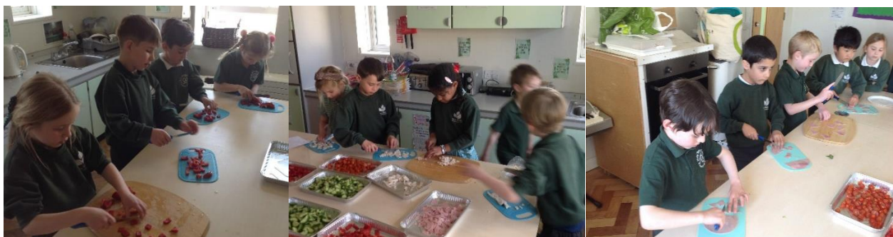
Year 2 made healthy wraps as part of their D&T unit! First, they prepared all the ingredients by practising their chopping and grating skills. The next day they assembled their wraps.