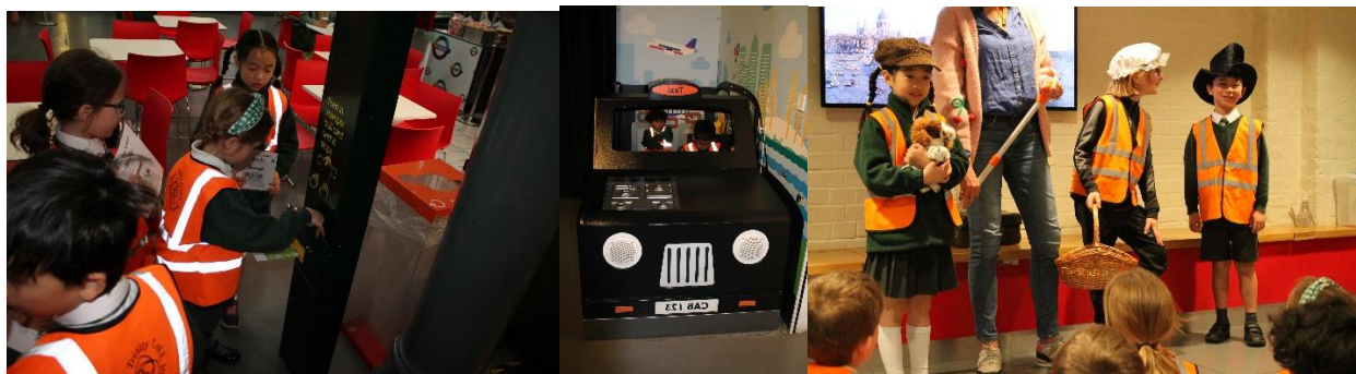
Year 3 had a wonderful trip to the London Transport Museum on Wednesday. They learnt all about the various modes of transport used in the past in preparation for their next Humanities unit on the Railway Revolution.