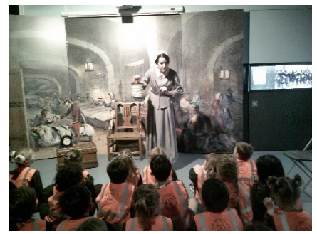
As part of their history topic, Year 2 visited the Florence Nightingale Museum this week – they learnt so much.