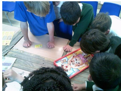
Year 5 enjoyed play games together during Golden Time today.