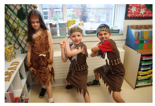
Year 3 are not usually this feral! They had a great day learning about the Stone Age for their history topic.