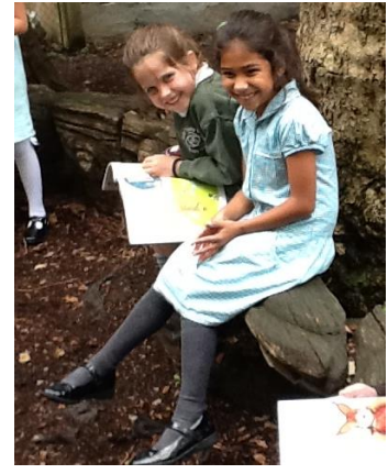
Wherever you look, Year 2 are reading. They have read in the playground, in the Wild Garden, in the library and even on the stairs.