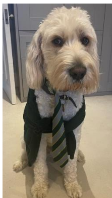
Bailey, the Devlin family dog, got dressed up ready to come to school!