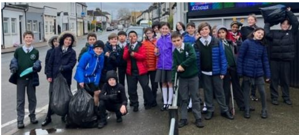
6H went on their Lent Appeal Sponsored Litter Pick today. They filled five bin bags of rubbish from the streets in our local community!