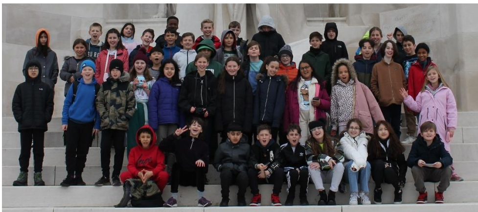
A few snapshots from the Year 6 visit to France. Many more photographs will feature in the Yearbook.