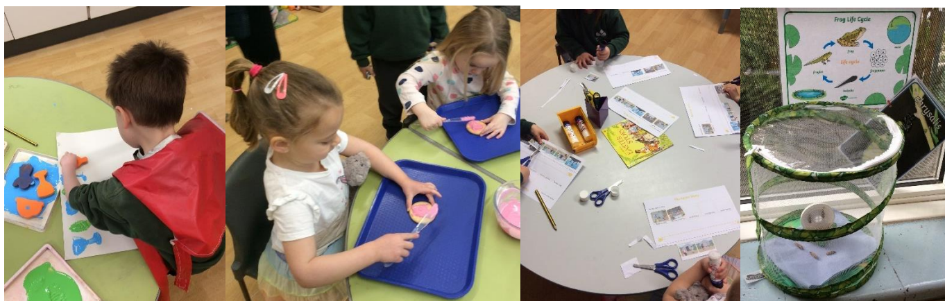
Nursery have been busy learning all about the Easter story this week; cutting, sequencing and sticking to make a storyboard and using Easter stamps to make colourful pictures. We also enjoyed decorating some Easter biscuits. The Nursery caterpillars have had an exciting week too - and have pupated into chrysalises!