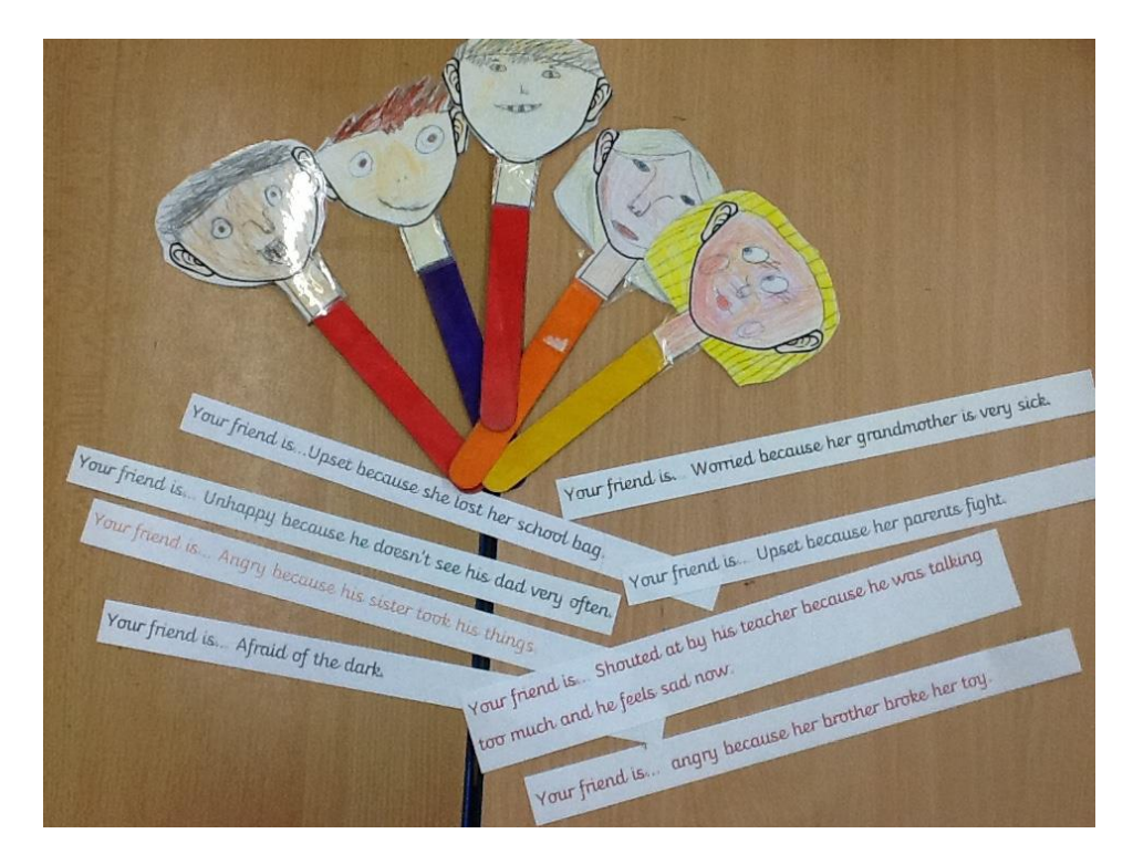
In PSHE, Year 2 made puppets of themselves to role play 'How to Help a Friend' during their conflict.