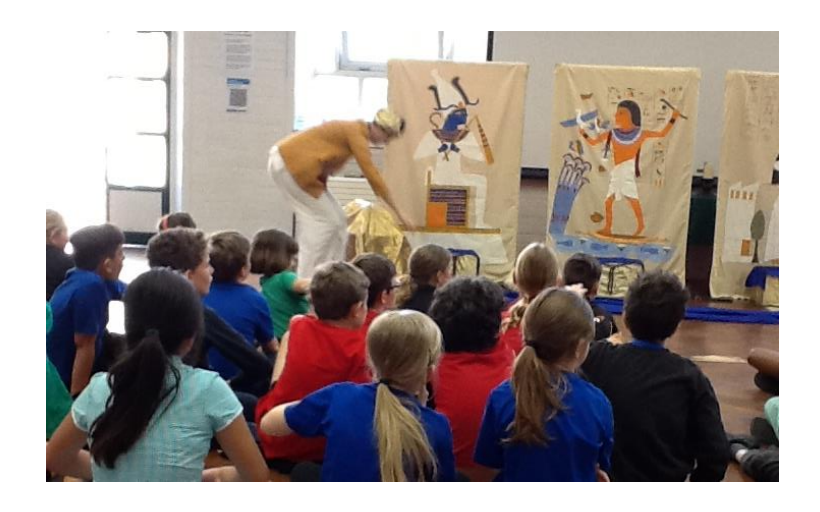
Year 4 had a fantastic start to their Ancient Egypt topic on Tuesday. They watched a performance and took part in workshops provided by Freshwater Theatre company.

The children have quickly got back into learning, with many year groups starting new topics.