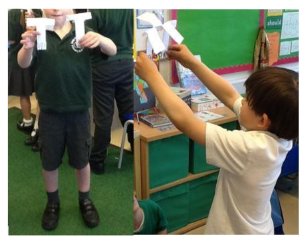
Year 2 thoroughly enjoyed investigating gravity by dropping paper spinners. They attached paper clips to one of them, and left the other without any paper clips, to see which spinner would hit the ground first.