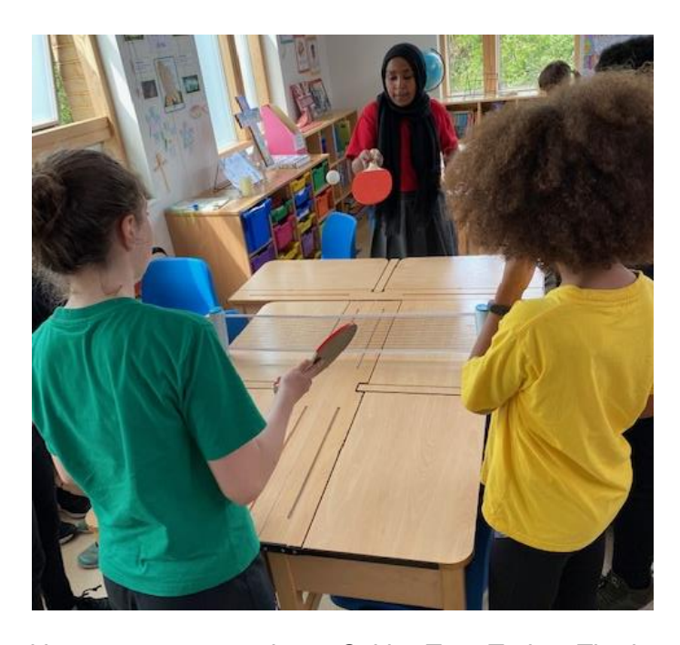
6H have enjoyed their new table tennis equipment during Golden Time Today. Thank you to the parents of 6H who purchased Amazon vouchers for the class to enjoy.