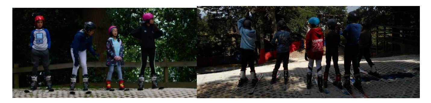
Year 6 visited Sandown on Tuesday for a fun day of Ringo, High Ropes and Skiing. I'm please to say that they all returned with no injuries.