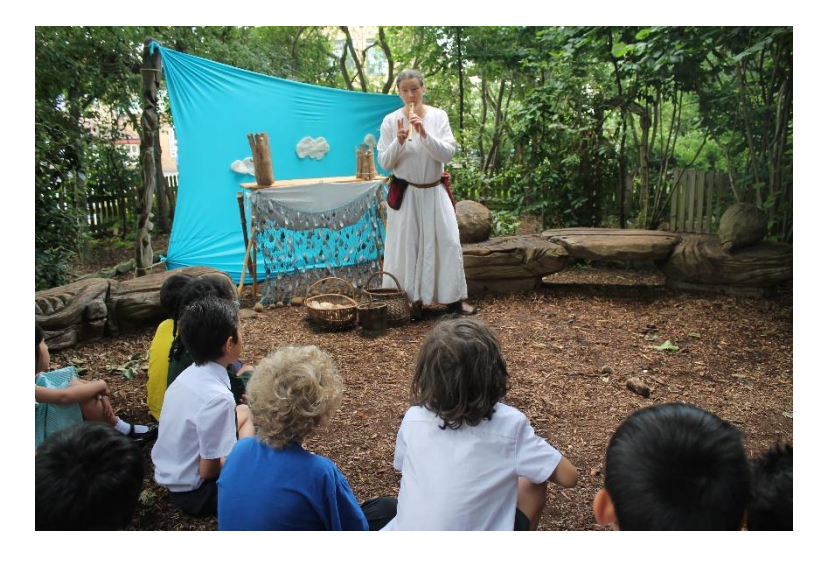
Year 3 were treated to a Puppet show on Monday morning. Great fun was had by all. A huge thank you to Noosh's mum for treating us!