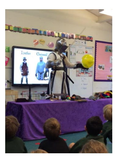
During their Castle Workshop, Year I had a brilliant time learning about knights and castles and were able to try on armour, learn to juggle, medieval dances and lots more. They had a great day!