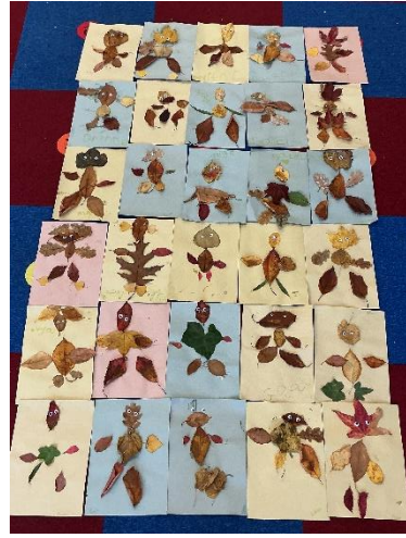
Reception have had a busy week making Diva lamps and creating wonderful leaf pictures.

Every year, the children at Holy Trinity create amazing Christmas themed designs which are then made into cards or other personalised items to share with friends and family. You can purchase them from 'Art Projects for Schools' (APFS), and at the same time help raise money for our school.