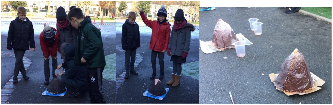
Year 6 made these volcanoes as part of their Extreme Earth Geography unit.