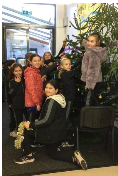
Decorating the tree was a team effort this year!