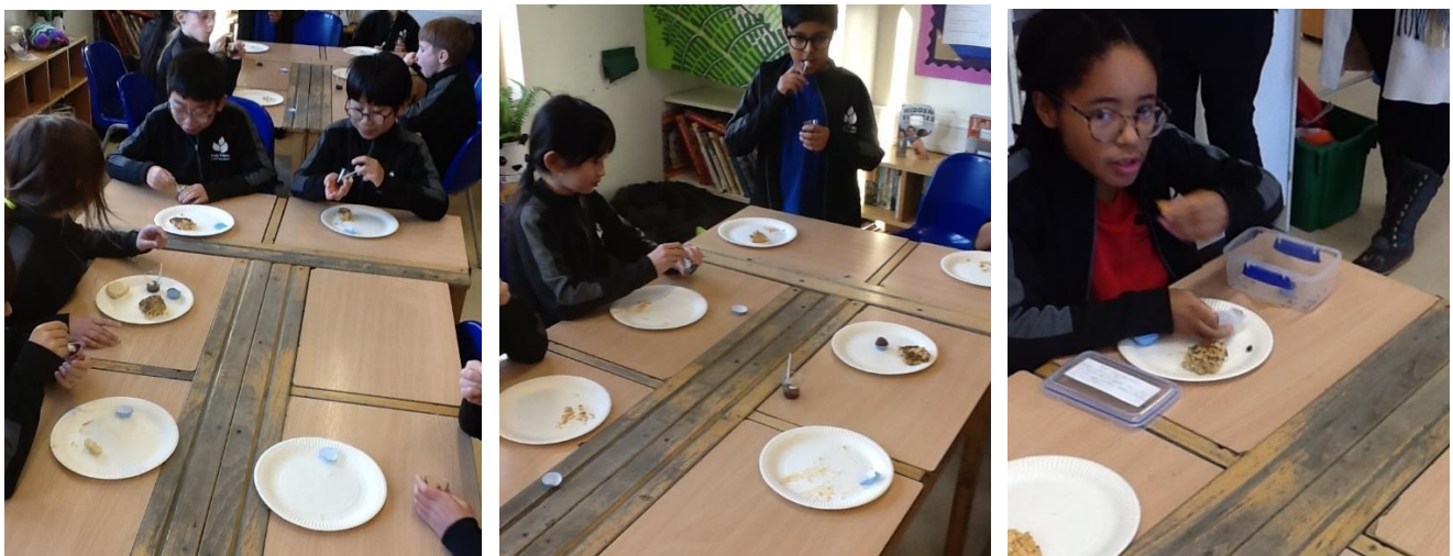
Year 5 held a cultural day yesterday. Each child prepared a presentation for their class all about their culture and heritage. The children also brought in some of their traditional food to share. The children learnt so much (and ate a lot too).