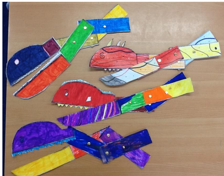
As part of their Design and Technology unit, Year 2 have been exploring pivots, levers and linkages and applied this knowledge when making their own 'Moving Monsters'.