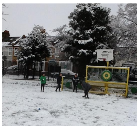
Fun in the snow!