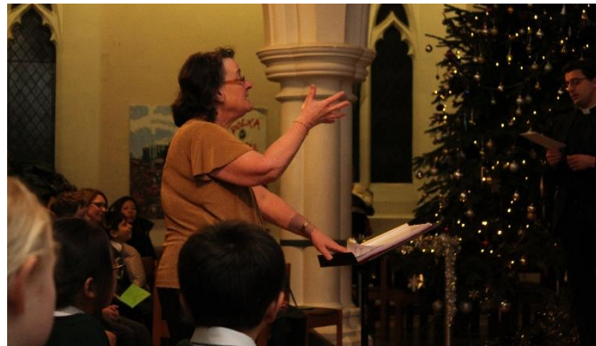
Our KS2 Carol Services at Holy Trinity Church.