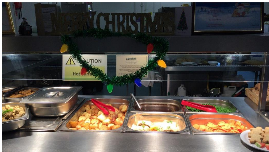
We all enjoyed a delicious Christmas lunch this week. Thank you to our wonderful team of cooks in the kitchen.