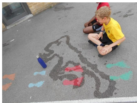
Year 5 enjoyed doing water art too. It was a good way to cool down too!