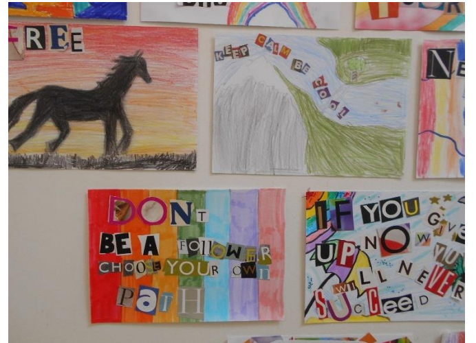
Year 5 created these wonderfully uplifting inspirational postcards in art.