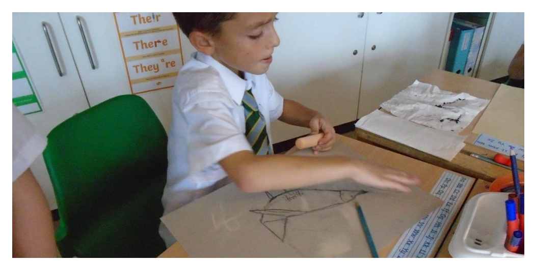
Year 3 designed prehistoric animals using shapes, charcoal and chalk during their art lesson.