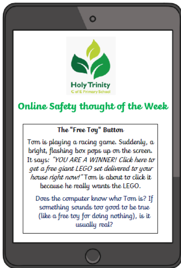
KS1 Online Safety Thought