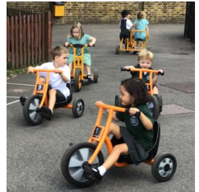
Reception children 'getting busy' in their first week at school. They also made rice cake faces to show different emotions!