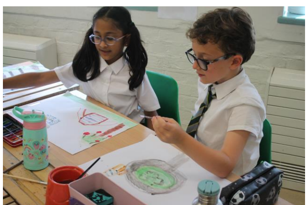
Art inspired by the book, The Promise .