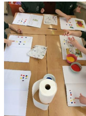
Year 1 learnt how to mix colours in art this week.