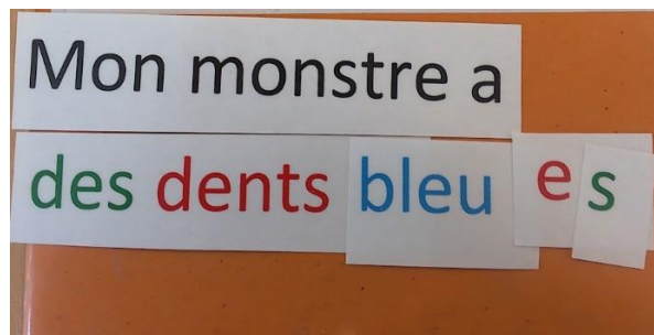
Year 4 finished off writing their monster descriptions in French this week.