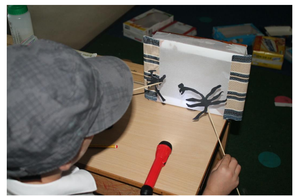
Year 3 had fun making shadow puppets as part of their Art and DT curriculum.