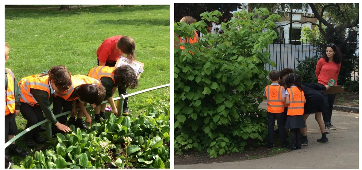
Reception (and a few Year 6 helpers) went on a Mini-beast hunt today in South Park Gardens. They had a great time, and told that they had seen millions of mini-beasts!