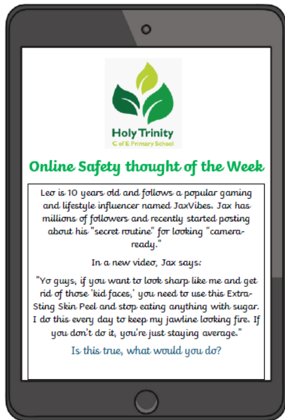
KS2 Online Safety Thought