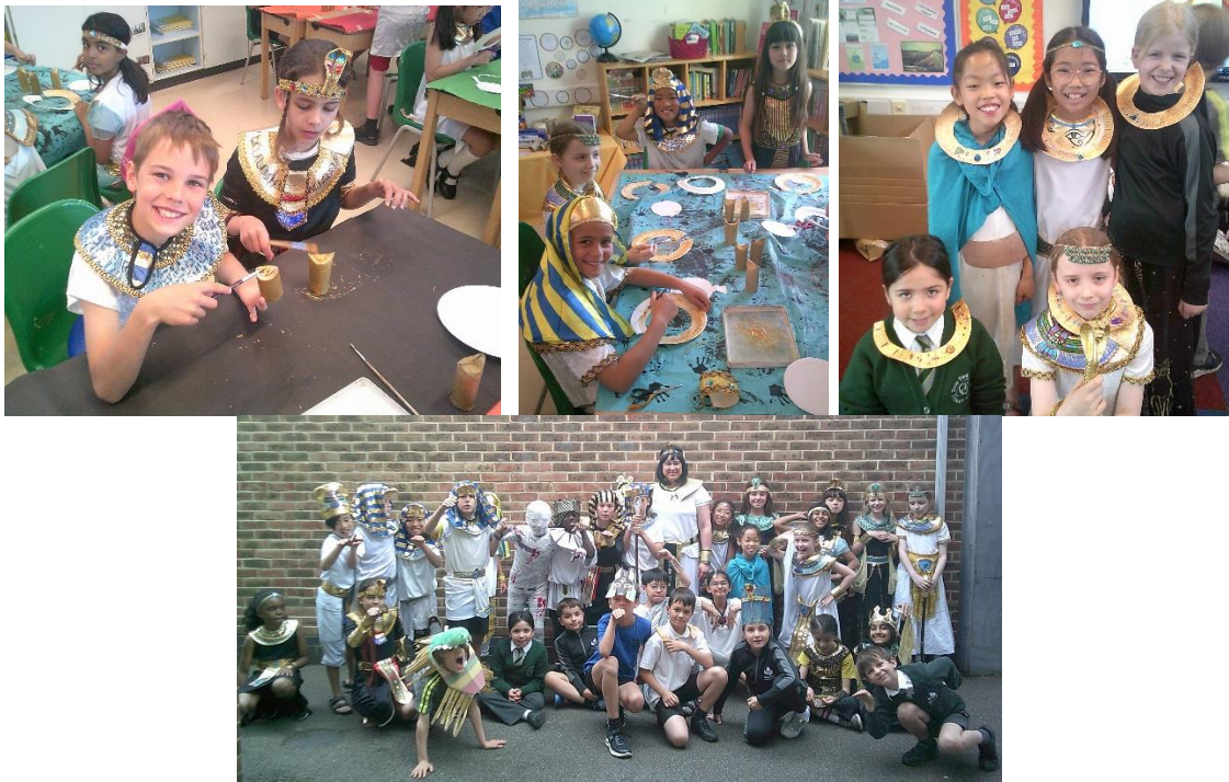
Year 4 immersed themselves in all things Ancient Egyptian today with a day full of arts and crafts; making shabtis, necklaces and designing scrolls which they will complete next week!