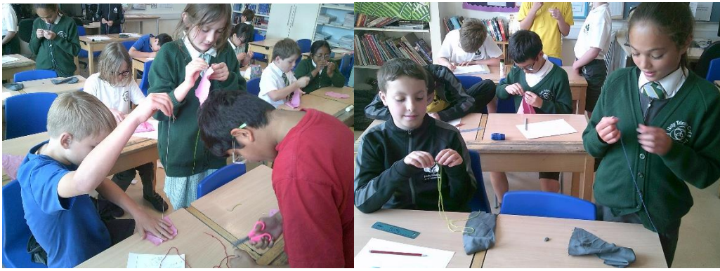
Year 5 have begun designing their stuffed toys and practising their stitching.