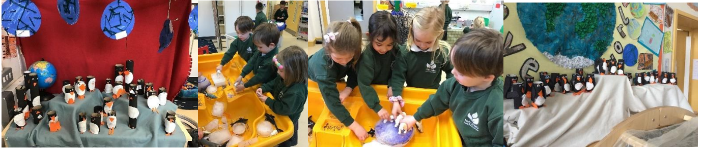
Reception children have been exploring 'Arctic and Antarctic Animals' and created lots of different crafts and lovely writing!