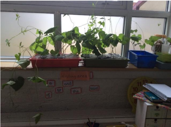
Before half term Reception planted their beans - look how they have grown!