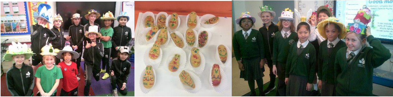
Easter fun today!